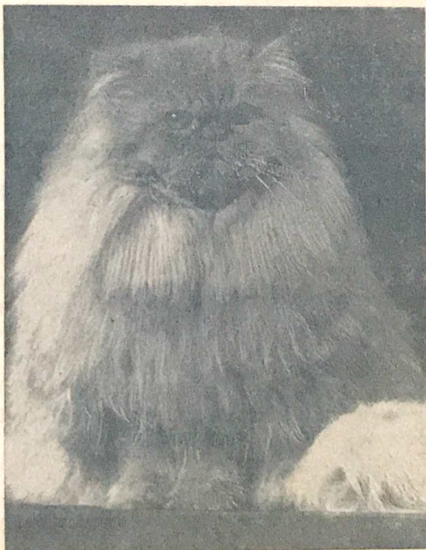
GR. CH. ZENITH MARCUS (4)

Longhairs of quality in Pure Blue, Cream, Blue-Cream, Red, Tortoiseshell, Black, Tortie and White and Bi-Colour