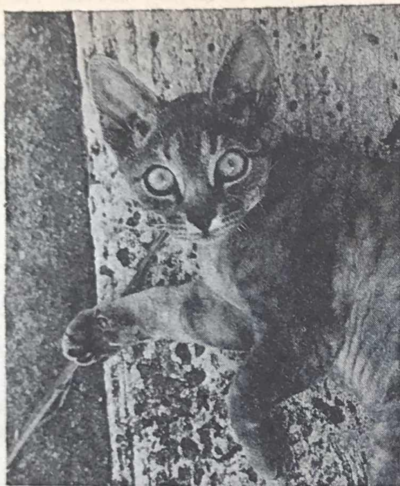
ANNELIDA APRIL LOVE—DEVON REX